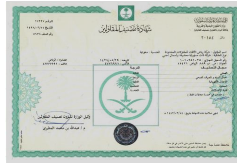
3rd Degree Classified Contractor